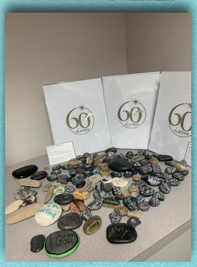
World Service Office