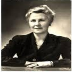
Lois Wilson Al-Anon founder

In 1951, Lois followed her husband Bill's suggestion (who had crafted the 12 steps of AA) to create a similar 12-step program for the family and friends of alcoholics.